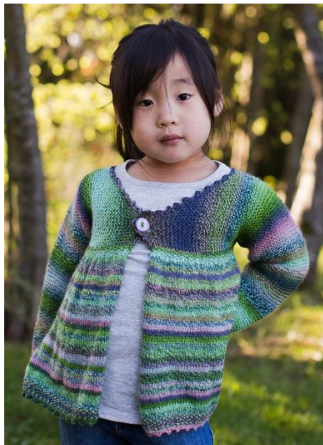
Zauberball Stärke 6 #2170

Designed by The Sassy Skein for skacel collection, Inc.