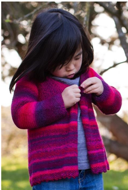
Zauberball Stärke 6 #2095