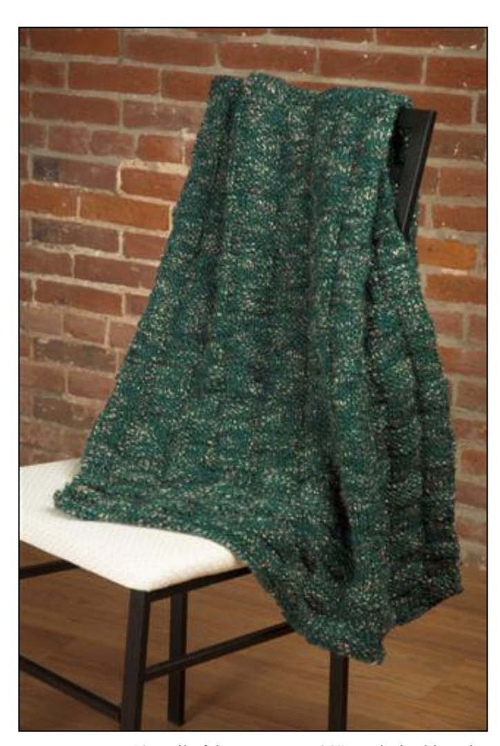
Repeat rows 1-12 until afghan measures 38", or desired length, ending with row 1 or 7. Bind off. Weave in ends.

Size: Approx. Finished Size: 32" x 38". Materials: 6 - 100g balls of Coffee Beenz. Needles: 24" circular size 13, or size needed to obtain gauge.