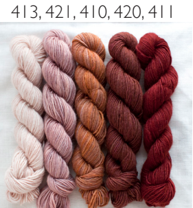
#5 - Eleanor