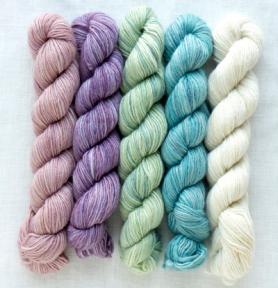
#8 - Henrietta