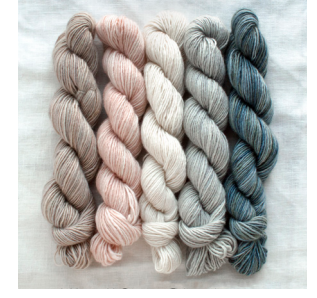
#3 - Clarissa