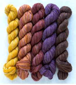
#9 - Irene