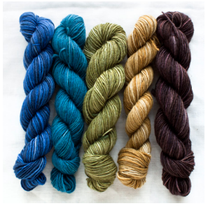
#7 - Georgiana