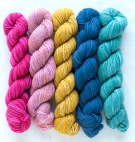
#10 - Josephine