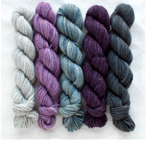
#2 - Beatrix