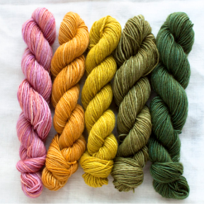
#4 - Dorothea