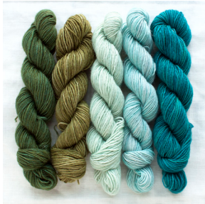
#6 - Flora